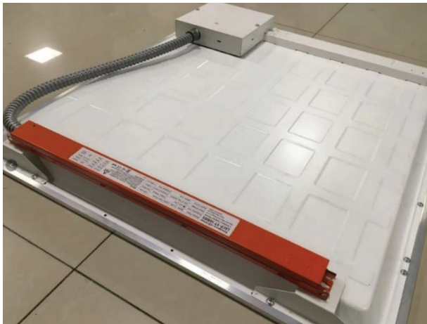
15W Emergency Battery

Control Options: CCT selectable, Power selectable, 0-10V Dimming, Emergency Backup