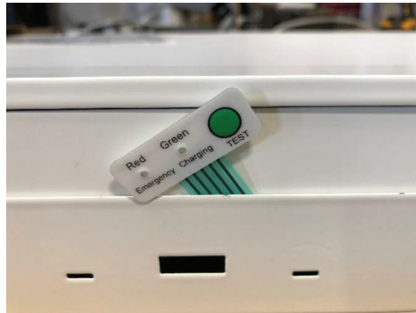
Emergency Test Button