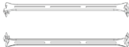
Mounting T-Bar Kit for Emergency Battery