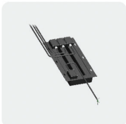
04. Separate Driver Module