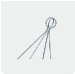
02. Steel suspension cable

Motion sensor, Steel suspension cable, Suspension Ring, Separate driver module, Bird spikes, 10KA / 20KA Surge Protection Device, Back Light Shield, Safety Cable