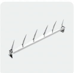
06. Bird Spike