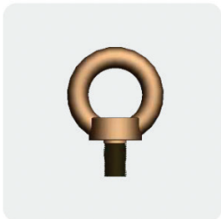
03. Suspension Rings