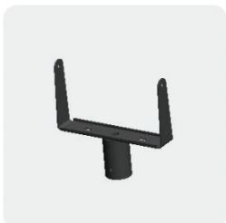
05. Garden Light