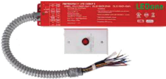
Emergency Battery LOC-EMDR-25WHV